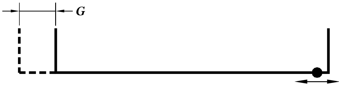
Figure 2; Hot Piping Run with One Longitudinal Restraint at the End of the Run

If however, the longitudinal seismic restraint is placed on one end of the run as shown in Figure 2, the expansion will effectively be on one side of the restraint, and all of the growth, G , will occur on one end.